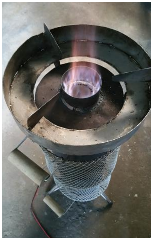
Pictorial of CNC BTRHGS Model 20-D1

The stove, shown at the right, is an enlarged version of the basic design of the batch-type rice husk gas stove. Instead of the conventional 14cm-diameter by 55cm-high reactor, the stove adopts a 20cm-diameter by 55cm-high reactor for the same size of fan. The burner gas outlet is reduced and gas holes are made compact to direct the burning gas to the bottom of the cooking pot. The burner has an enclosure to shield the flame from wind and, at the same time, to collect spilling water. A removable fan enclosure is provided for the stove to quickly detach the fan from the reactor when unloading the char.