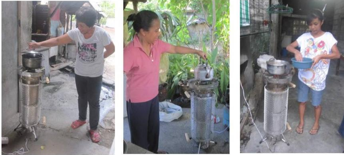
Stoves Being Tested in the Philippines

the pot was observed during the first 10 minutes of the operation and gradually decreases for the remaining period.