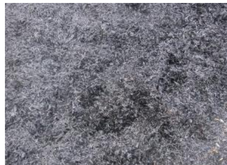
Sample of Char Obtained from the Stove