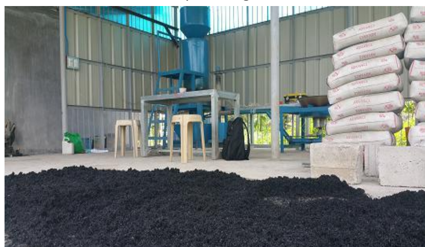
Figure 4. Pictorial of the Char Produced from the Stove.

The stove can be fabricated using local skills and materials. The electric