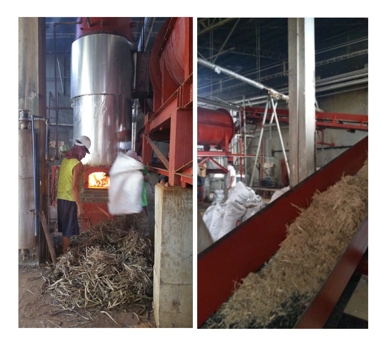
Figure 4. The Biomass Furnace.