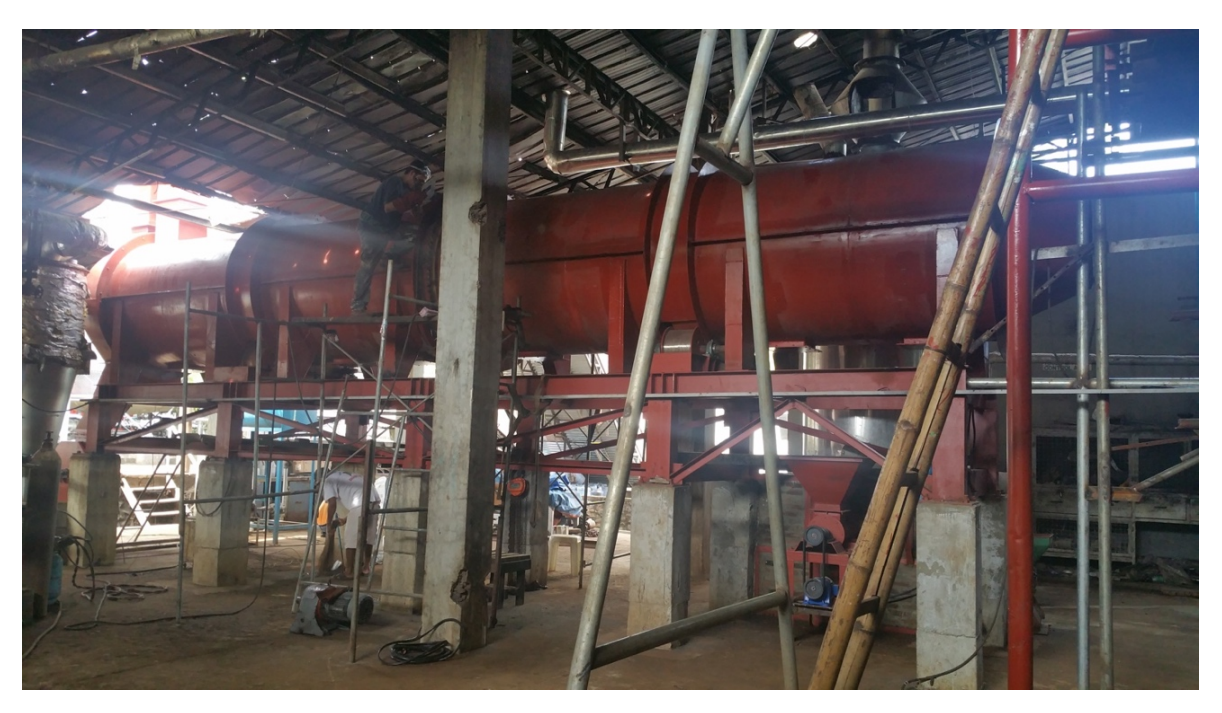
Figure 3. Right-Side View of SCBT.