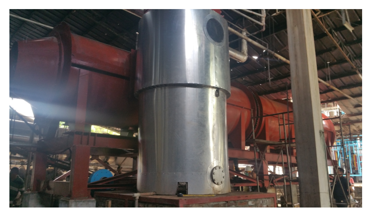
Figure 2. Left-Side View of SCBT.