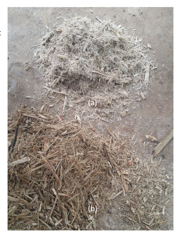
Figure 7. Samples of (a) Raw and (b) Torrefied Sugar Cane Bagasse.

trash in the furnace is 45.3 kg per hour with material-to-fuel ratio of 0.75. Measurement of temperature showed that at the furnace combustion chamber the reading obtained ranges from 640° to 805°C, that at the duct between the furnace and the rotating cylinder ranges from 468° to 674°C and that at the chimney outlet ranges from 95° to 150°C. Surface temperature taken at the inlet section of the stationary cylinder using infrared thermometer ranges from 299° to 440°C and that at the outlet end of the cylinder ranges from 53° to 70°C. It was observed that torrefied sugar cane bagasse, shown in Figure 5, have light-topale=brown color which is lighter as compared with that of raw sugar cane bagasse. Exposing torrefied sugar cane bagasse in the atmosphere for 6 hours slightly increased its moisture adsorption from 0 to 6.8% for non-hammer-milled samples while 0 to 8.4% for hammermilled samples.