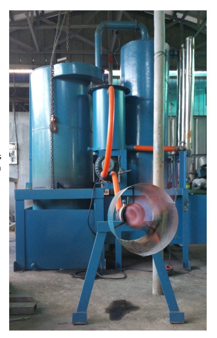
Figure 1. The Induced-Draft Rice Husk Gasifier with Wet-Scrubbing Unit and Jet-Type Burner during Operation.

Gasification of biomass is becoming of interest to many for not only it is a versatile method of producing heat and power, but more so, it produces char as by-product which can be used as a material for soil amelioration and a means to sequester carbon. Among the different technologies used in the gasification of biomass, the movingbed downdraft-type gasifier reactor is becoming popular among technology developers for it can be operated in a continuous-mode eliminating the need to reload fuel and re-start after 2 hours of operation. The induced-draft, which induces air to the reactor during gasification, is of more advantage over the forced-draft method for a number of reason. By induced-draft, the startup of the gasifier is much simpler and shorter as compared with the forceddraft type gasifier. The gasifier, which is described in this brief paper, is the result of the developmental effort undertaken by the Carbon Neutral Commons (CNC) to come up with the design of a rice husk gasifier equipped with an induced-type source of power for heating application. The gasifier system is equipped with wet scrubber, packed-bed filters, and tar strippers to clean and cool the gas thus minimizing tar problem commonly encountered in other gasifier systems.