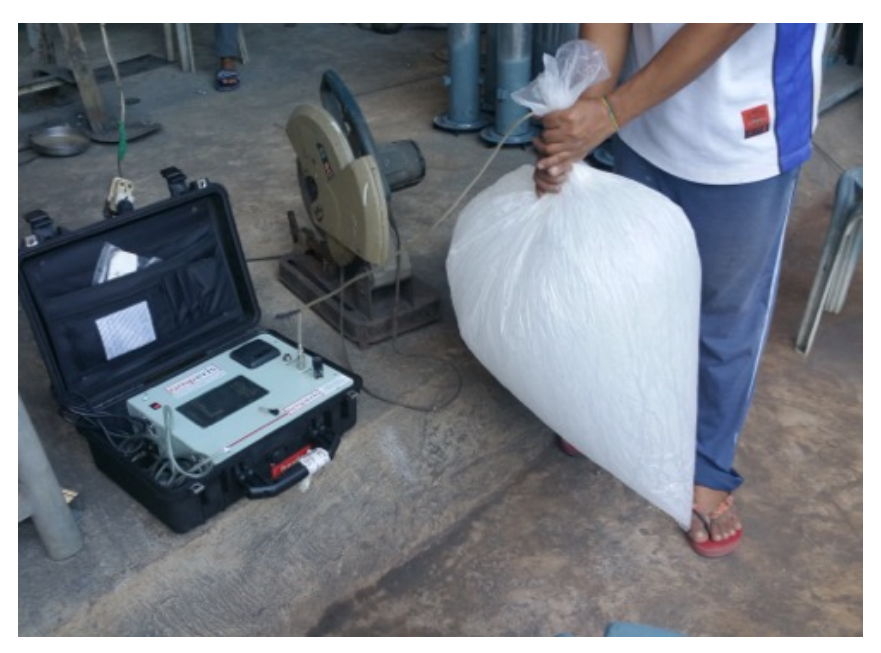
Figure 6. Gas Composition Measurement Using the Amperis Transdox Gas Analyzer.

Measurement of the composition of gas (Fig. 6) emitted from the gasifier using Amperis Transdox Gas Analyzer, Table 3 showed that the amount of carbon monoxide (CO) gas obtained ranges from 12.3 to 13.07 %; whereas, that of hydrogen (H<sub>2</sub>) and methane (CH<sub>4</sub>) gases obtained range from 8.02 to 8.23% and 3.82 to 3.92%, respectively. Carbon dioxide (CO<sub>2</sub>) and oxygen (O_2) gases obtained were at the range of 5.34 to 5.84% and 5.80 to 5.87%,