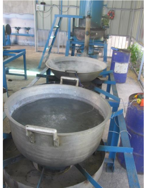
Figure 2. The Stove During Testing.

Rice husk fuel is ignited at the bottom of the reactor to start-up. The fire zone formed upon ignition of fuel starts to move from the bottom to the top of the reactor. Continuous operation of the stove is sustained by maintaining the fire zone at the middle of the reactor, which is attained by discharging the char as the fire zone goes up. The gas produced exits from the reactor through an exit pipe passing through a particle separator to separate large char particles from the gas stream before the gas enters the burner. The gas exiting from the burner is ignited to provide the heat needed for cooking.