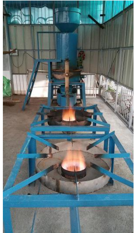
Figure 1. Pictorial and Design Specifications of CNC Double-

As shown in Figure 1, the stove consists of 40cm-diameter moving-bed downdraft-type reactor where rice husk is gasified with limited amount of air to produce combustible gases rich in carbon monoxide (CO), hydrogen (H 2 ), and methane (CH 4 ). This design is an improved version of the same technology developed in 2010 wherein a water-dousing device or a char bin is incorporated in the system to immediately quench burning char to discontinue combusting preventing it from turning into ash. The reactor of the stove is provided with a 2½-in. electric blower that supplies the needed air to gasify rice husks. The blower can be ran either by tapping from the grid or by using a 100amp-hour battery coupled to a 500-watt DC-AC Inverter. The hopper on top of the reactor serves as inlet for rice husk fuel and the rotating sweeper beneath the char chamber gradually discharges the char by dropping it into a water-filled bin to immediately quench the burning char preventing it