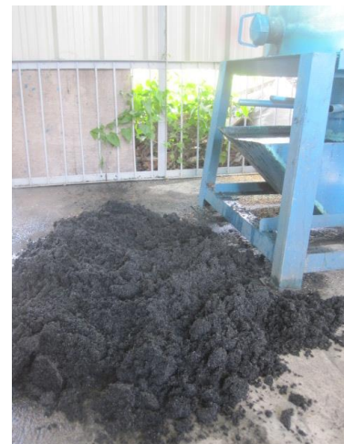
Figure 4. Pictorial of the Char Produced from the Stove Immediately After Removal from the Bin.

Carbon Neutral Commons 91 Brandon Ave. Toronto ON Canada M6H 2E2 www.carbonneutralcommons.org